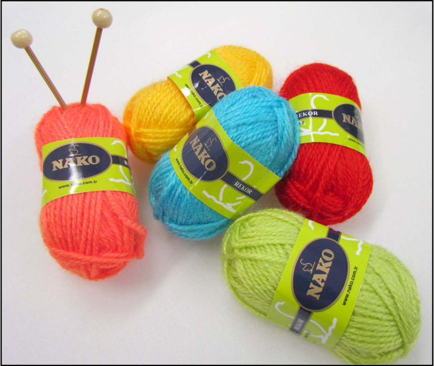
Rekor Mini Balls

Cup Cozy, Bike Seat Cover, and E-Book Reader