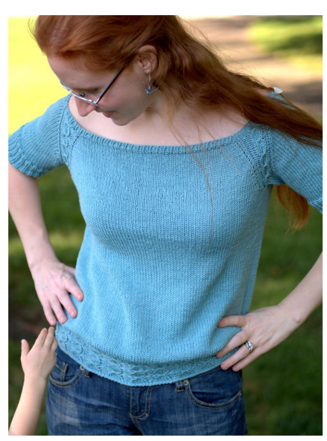
sizes. Pullover is worked in the round from the neck down.

To Fit Ladies Size: S, (M, L, XL, XXL, XXXL) Approximate Finished Chest Measurement: 35 ½", (38, 42, 44 ¾, 48 ½, 52)